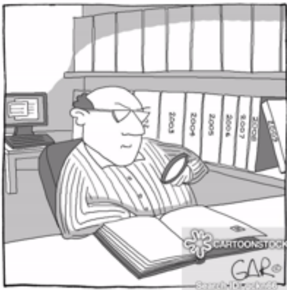
"20 years as Stamp Club Chairman and they send my retirement card by E-MAIL"