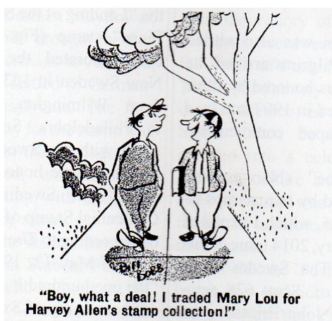
From ASDA & Stamp Collector News